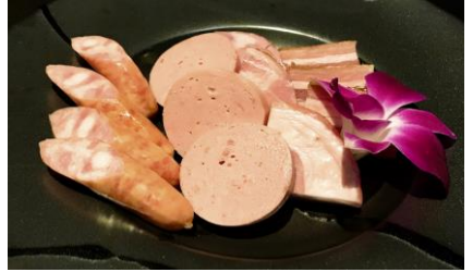
Assorted DLG Award Platter