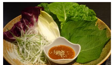
Assorted Roll-Warped Vegetables