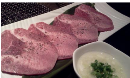
Beef Tongue with Salt and Green Onions