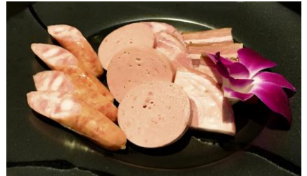
Assorted DLG Award Platter