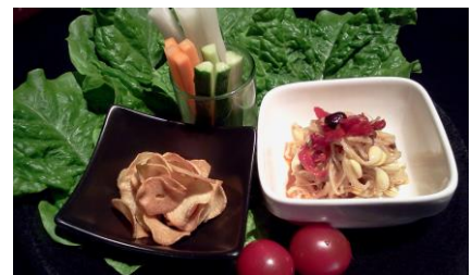
Assorted Roll-Warped Vegetables