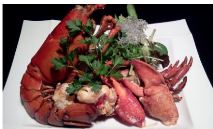
Canadian Freshwater Lobster