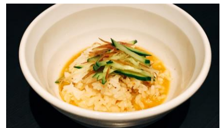
Hiyajiru (Cold Miso Soup)