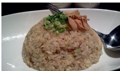
Fried Rice with Green Onions