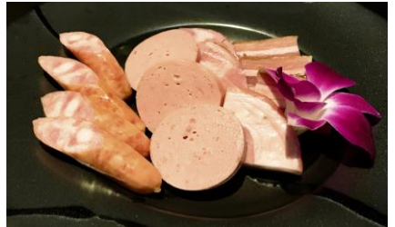
Assorted DLG Award Platter