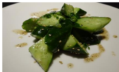
Chopped Cucumber Salad